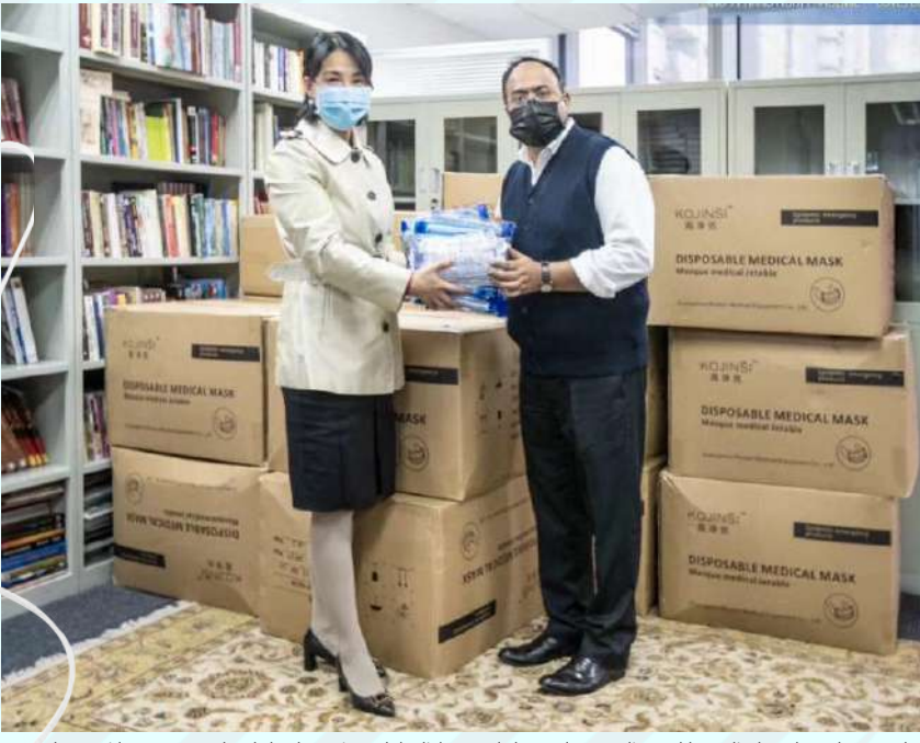
Guangdong Haid Group Co., Ltd and Shenlong Bio-Tech (India) Ptv. Ltd. donated 50,000 disposable medical masks to the Consulate General of India, Guangzhou, to help prevent the spread of the Covid-I9 pandemic.